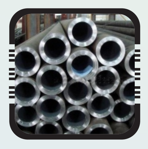
Boiler Seamless Carbon Pipes