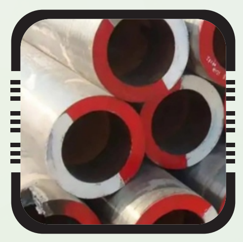
MS Seamless Hydraulic Pipe