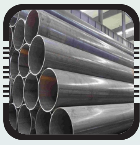
ASTM a106 MS Seamless Pipe