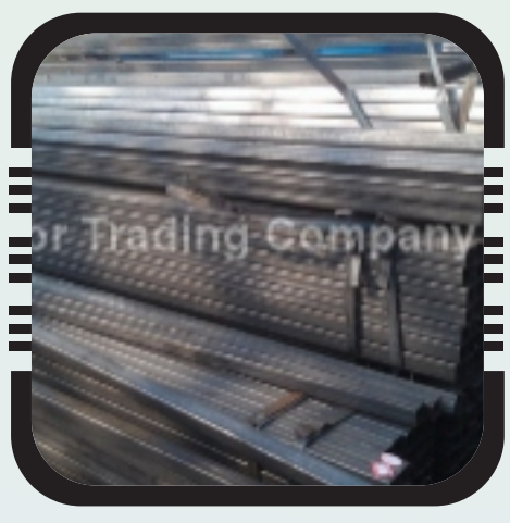
Ms Square Hollow Section