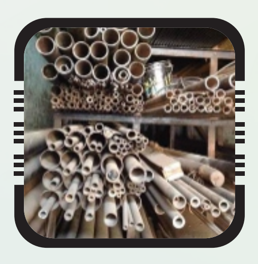
MS Seamless Tube