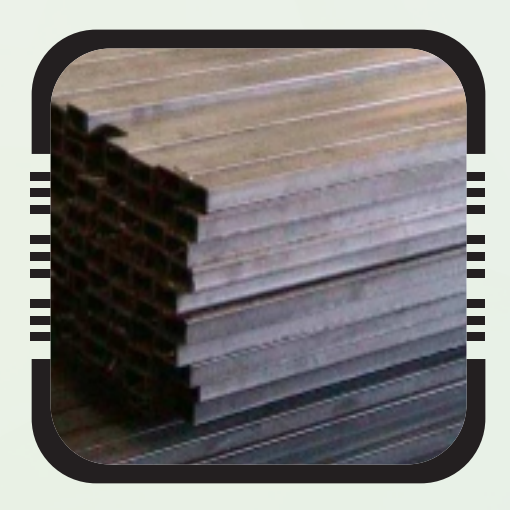
Carbon Steel Hollow Section