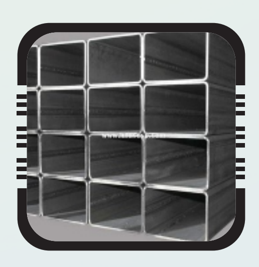
Prime Hollow Section