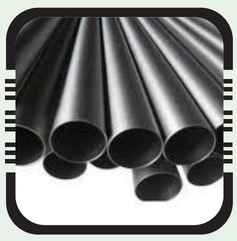
Mild Steel Black Pipes