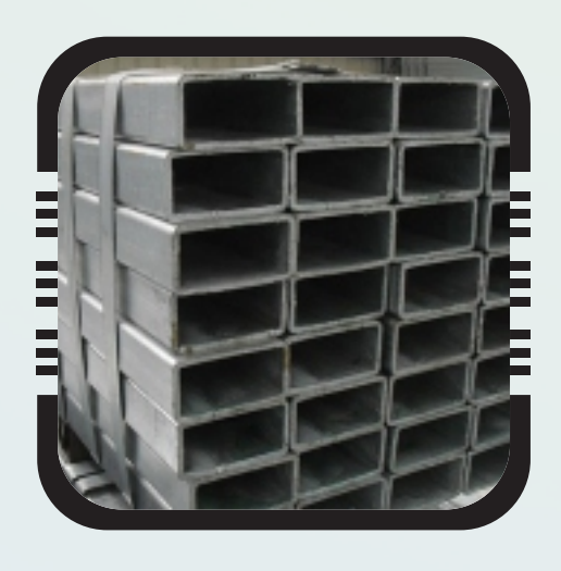
Rectangular Hollow Section