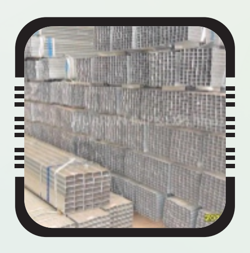
Ms Carbon Steel Hollow Section