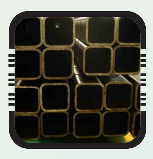
Hydraulic Hollow Section