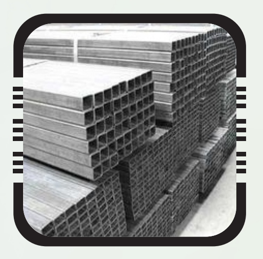
Mild Steel Hollow Section