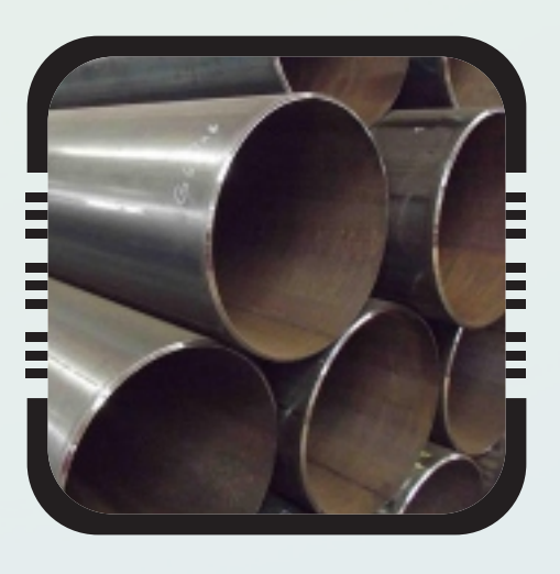
Welded MS Seamless Pipe