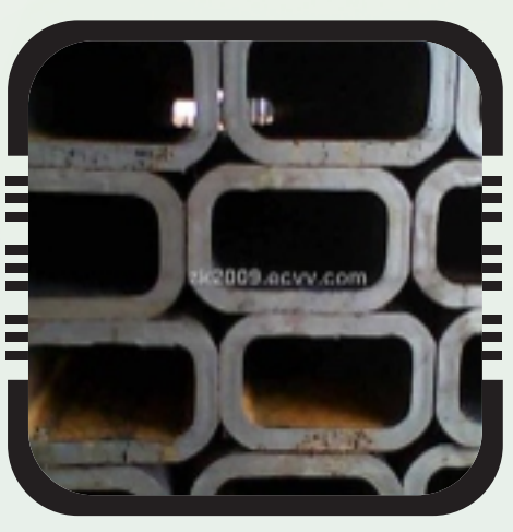
Seamless Hollow Section