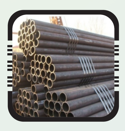
MS Seamless Pipe SCH 40